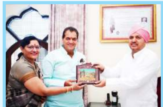
With Shri Prem Chand Aggarwal Minister of Uttarakhand