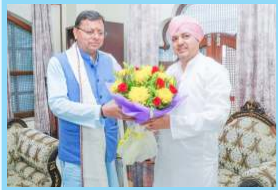
With Shri Pushkar Singh Dhami, CM of Uttarakhand