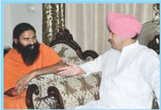
With Yog Guru Baba Ramdev