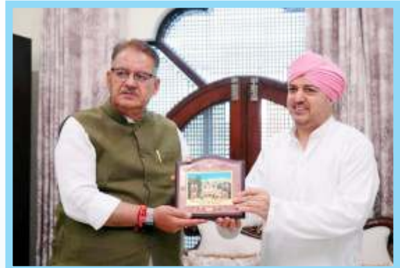
With Shri Ganesh Joshi, Minister of Uttarakhand