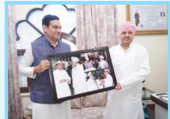
With Shri Saurabh Bahuguna, Minister of Uttarakhand