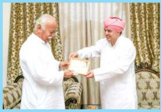
With Shri Mohan Bhagwan, Chief RSS