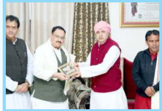
With Shri J.P. Nadda, President, BJP