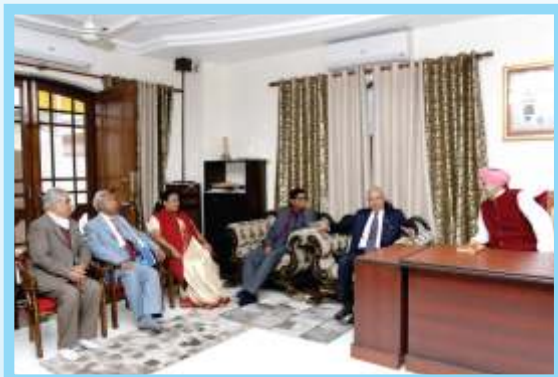
With NAAC Peer Team