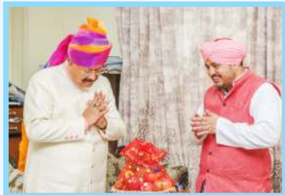
With Shri Satpal Maharaj, Minister of Uttarakhand